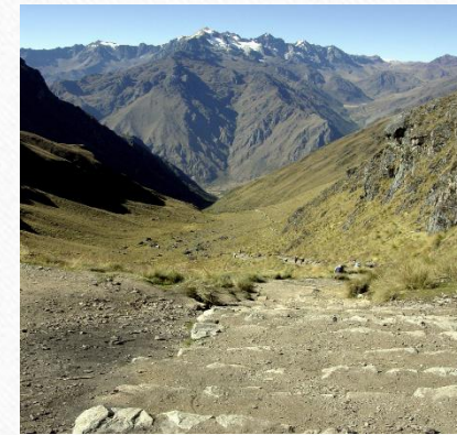
Image: The Inca's engineering of roadways and agricultural terraces in mountainous terrain was one key to the expansion of the empire.

Students integrate information from text, images, and maps to respond to the guiding question of the case study.